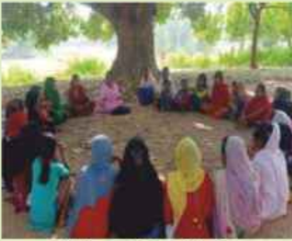
Adolescent Group Meeting