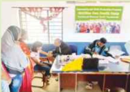
Blood group and Haemoglobin Checkup