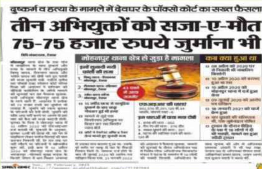
Media covers the news on First page

The survivor's family fought for justice and received it when all three of the defendants were given death sentences with the help of the support person.