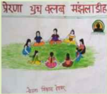
Art by Adolescent