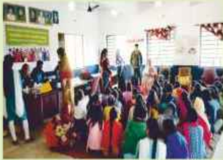
Health Awareness Camp with Adolescents girls