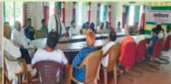
Meeting with traditional, religious leaders