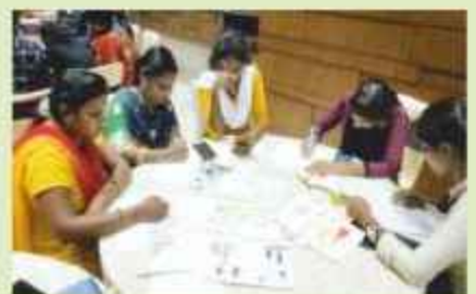
Workshop with Natural Leaders on Digitally story telling