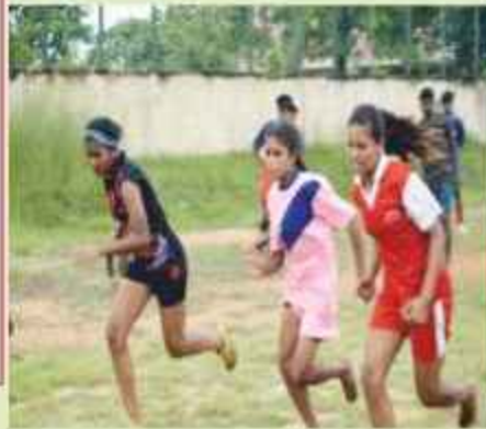
Adolescent girls participating in Sports

Providing alternatives to child marriage and mitigate the impact on married girls, through enhancing access to education, economic opportunities and child protection systems for girls and their families.