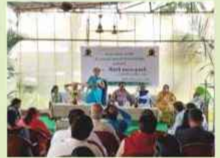
District level Advocacy on CLCP, Child rights and family planning