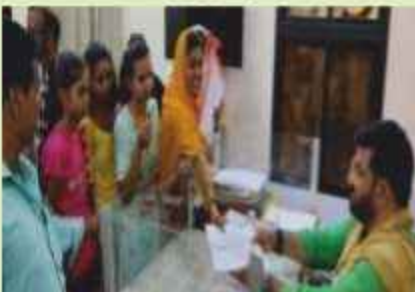
Adolescent demanded sports materials to Sports Minister