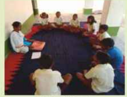
Bal Sansad Meeting