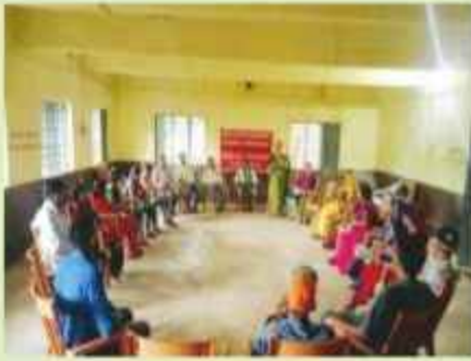
PRI member orientation on CLCP