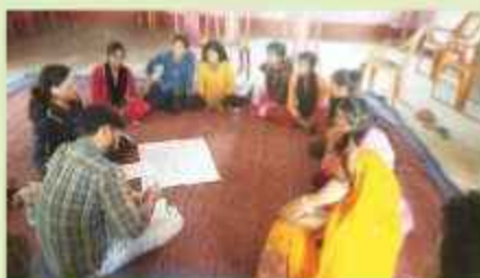
Praxis Team visit at various intervention area of PAR