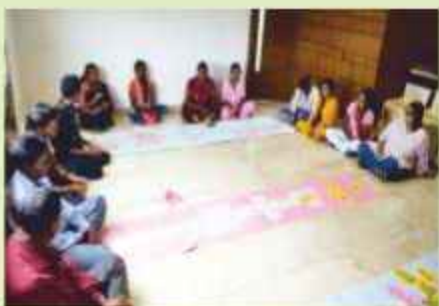
Workshop with Natural Leaders on Digitally story telling