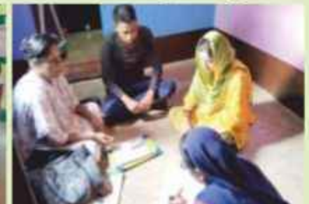
Counseling of newly married couple