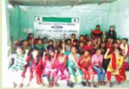
Capacity Building training of Adolescent