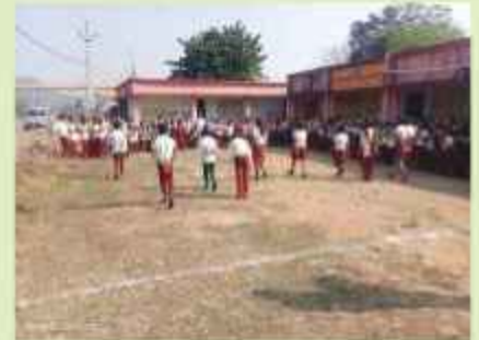
Sports competition on Children's Day