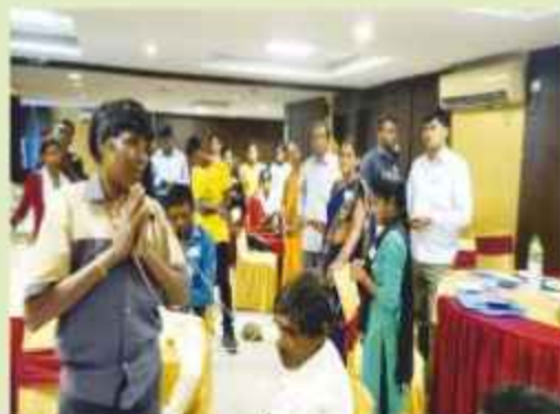
Workshop with Natural Leader on PRA tools, Micro-planning etc.