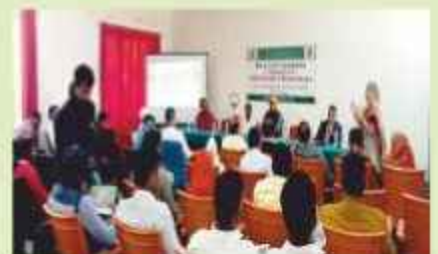
Block Level advocacy and sharing with all the Block officials, PRI members