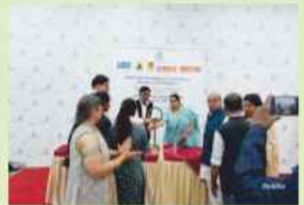
District level advocacy with District Officials on CLCP